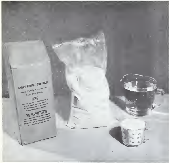
N-39859--In making liquid skim milk mix 1 part dry milk, 4 parts water.